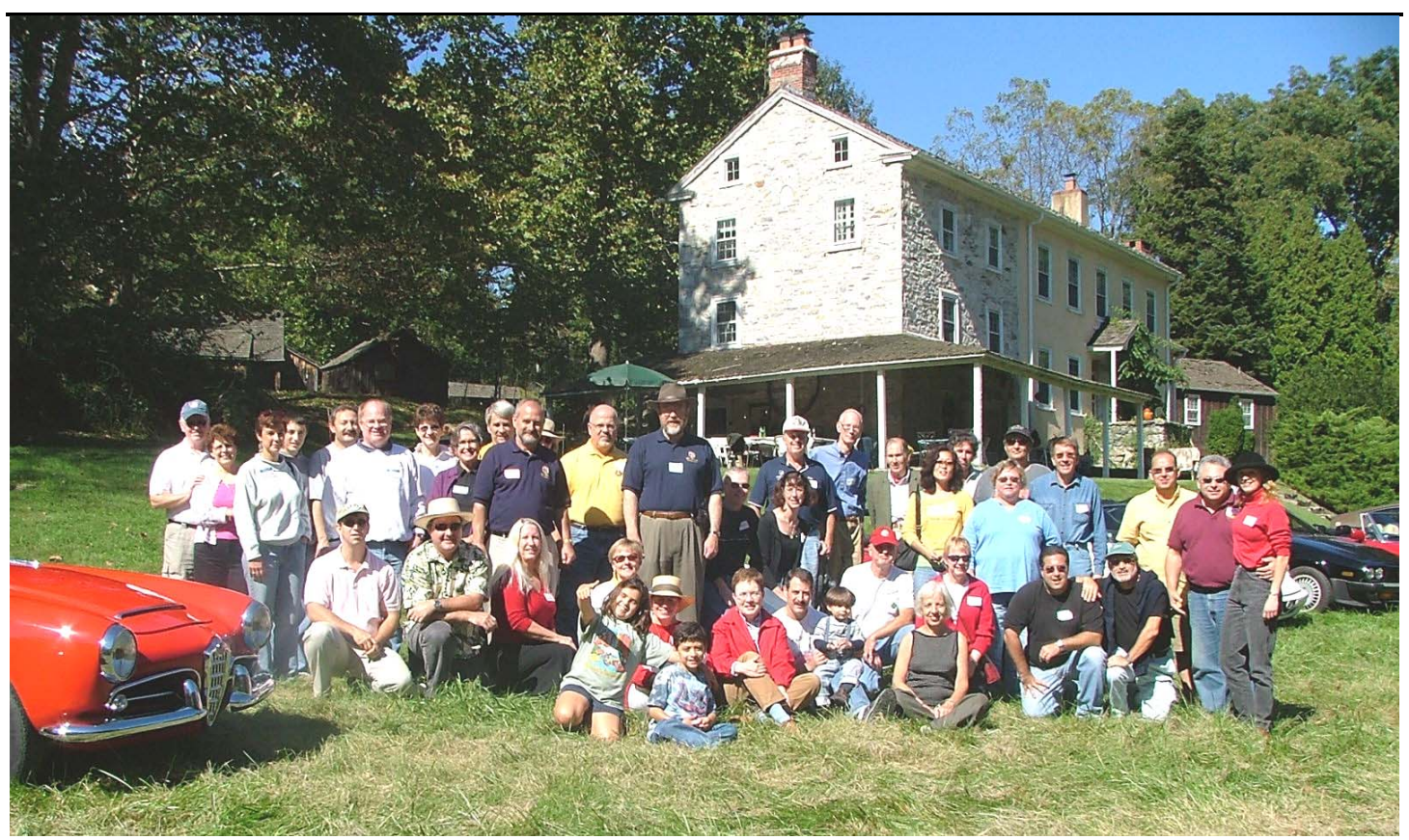
The 2004 DVAROC Fall Picnic at Brookside Farm