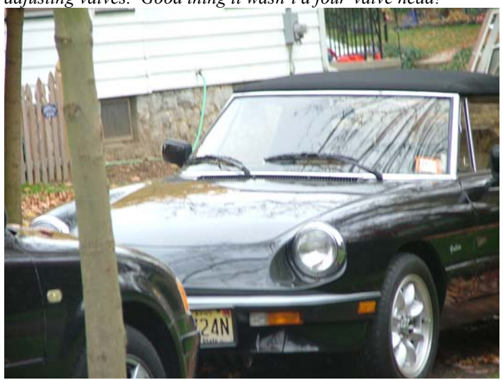
Fred Sack's Spider was looking great on this damp fall day