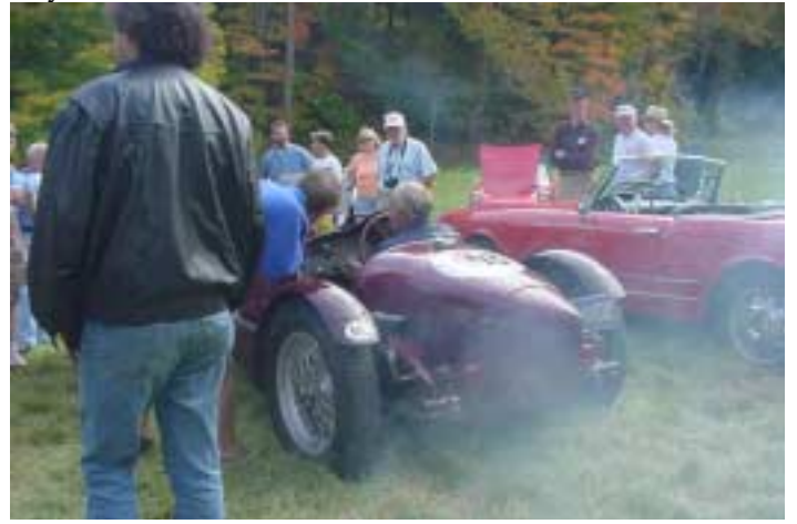
The Maserati 8C snorts to life in a cloud of Castrol

Driving the Maserati is clearly not for the faint of heart. In addition to keeping the high strung straight eight happy, the pilot has to keep away from the exposed driveshaft which runs between the pedals and under the seat! In addition to the spinning shaft, the rear wheels, just inches from the driver's shoulder complete the feeling of being an integral part of this mechanical thoroughbred. Stopping is state of the art for 1933, massive finned drums, actuated by cables. Willem has made some concessions to make driving this beast a bit easier. Starting is electric, avoiding the need to use the large crank at the front. It also sports a pair of modern driving lights for those nighttime Mille Miglia stages. The car is truly a time machine, built when very few race drivers lived into retirement.