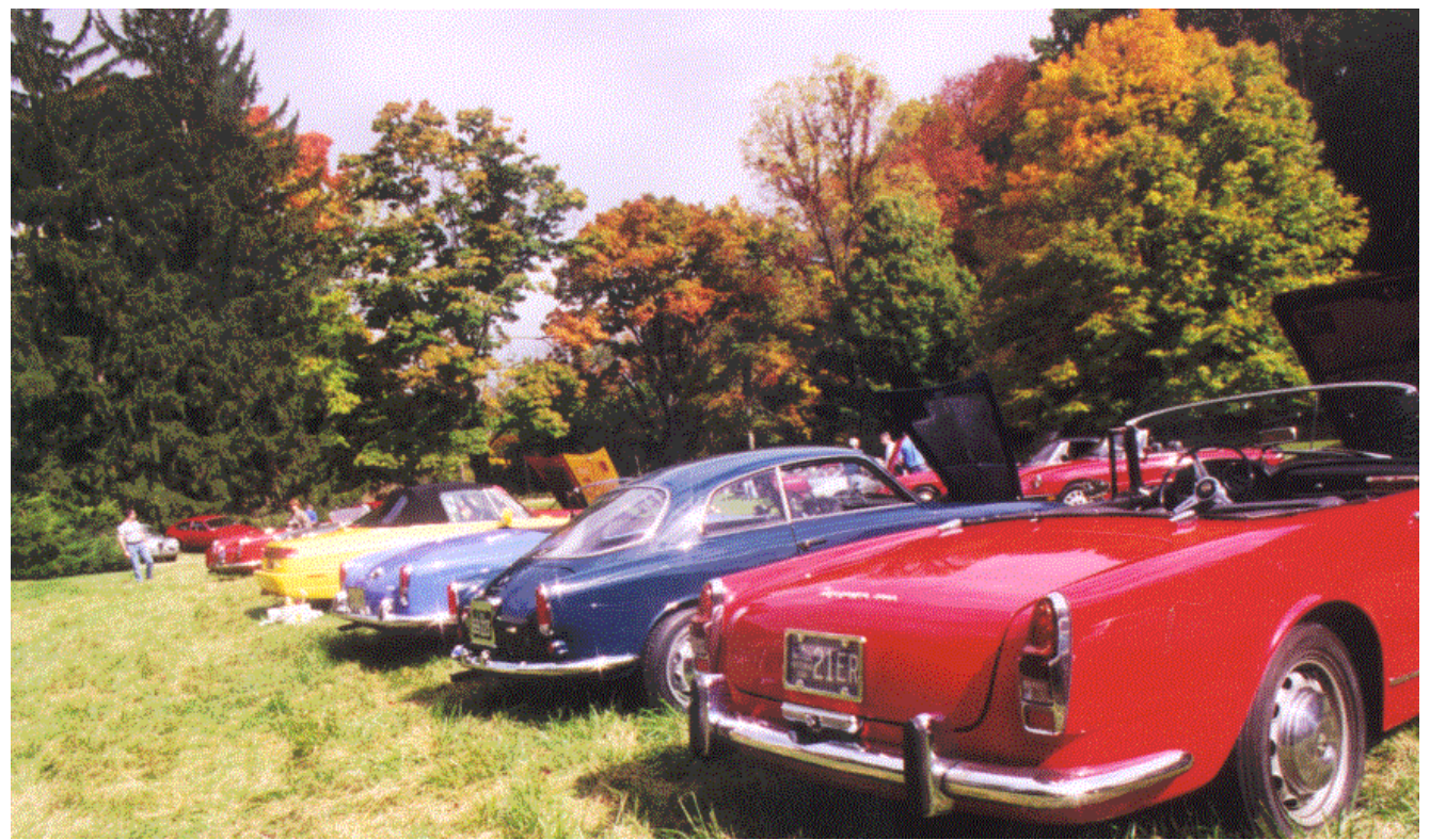
A Parting Shot from the Fall Picnic..... See You Next Year!