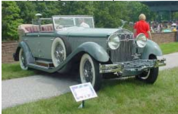
A magnificent Isotta-Fraschini sits proudly on the Concours lawn.