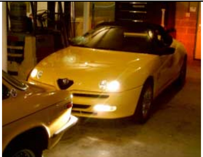
What's this? A new GTV in the Delaware Valley? Be on the lookout for it on the streets of Philadelphia.

Wanted: 1967 GTV, prefer original car. The nicer the better. Will pay market price. Day(908) 686-8236, Evening(973) 635-1932, email MWSINC2426@aol.com