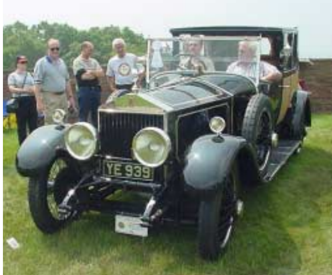
A Rolls Royce fit for a Queen, or at least a department store executive.

Overall, it was a worthwhile show, though it was clear that it lacked the corporate sponsorship and cache it attracted in years past. The 2004 show has already been scheduled and will feature "200 of the rarest, most elegant automobiles ever produced." I guess we'll find out.