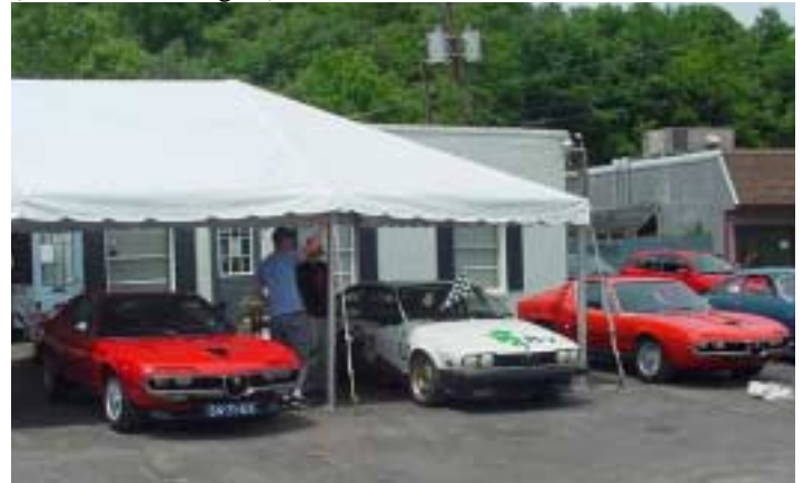
How often do you see two Montreals in one place?