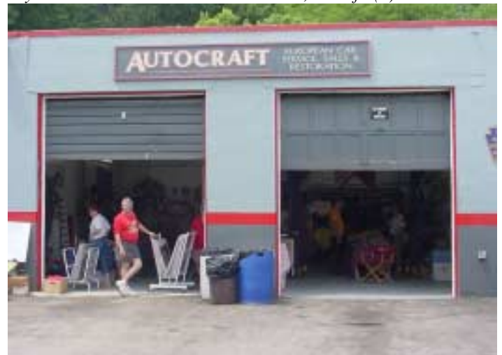
Autocraft in York, emptied of cars, filled with Alfa memorabilia and Italian food.