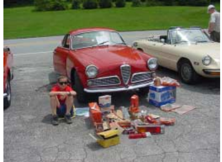
"Hey Mista, I'll give you a great deal on a Berlina hood hinge"