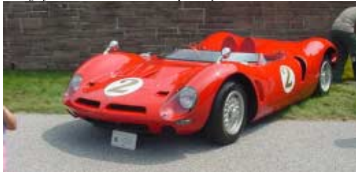
A Bizzarini sits poised to pounce among the American iron