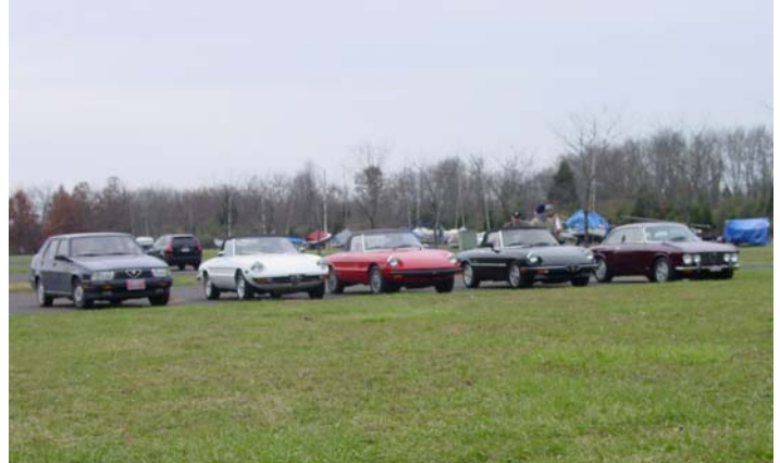
The partial starting grid of the Fall Rally through Bucks County