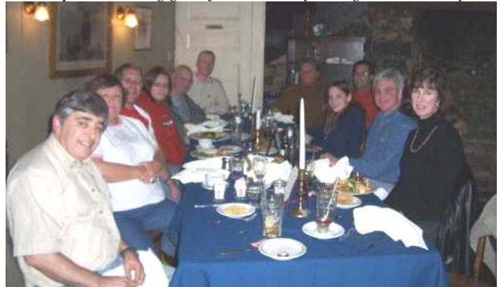
A satisfied lunch crowd inside.....