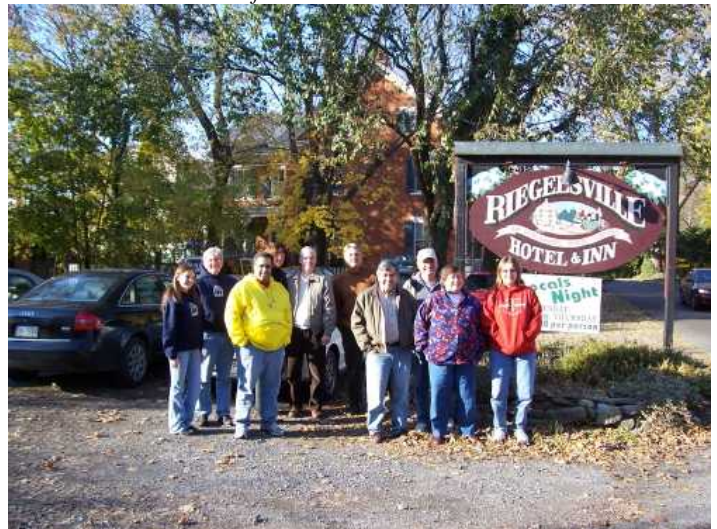
..... and outside the Riegelsville Inn