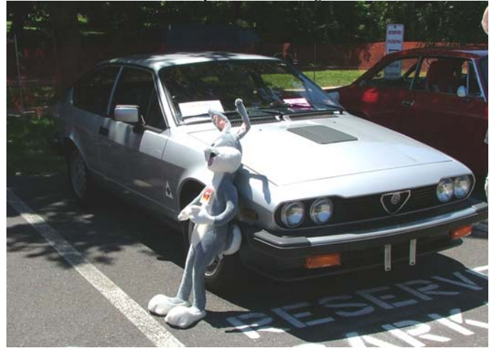
Bugs Bunny stands guard next to Bill Conway's pristine 1983 GTV-6