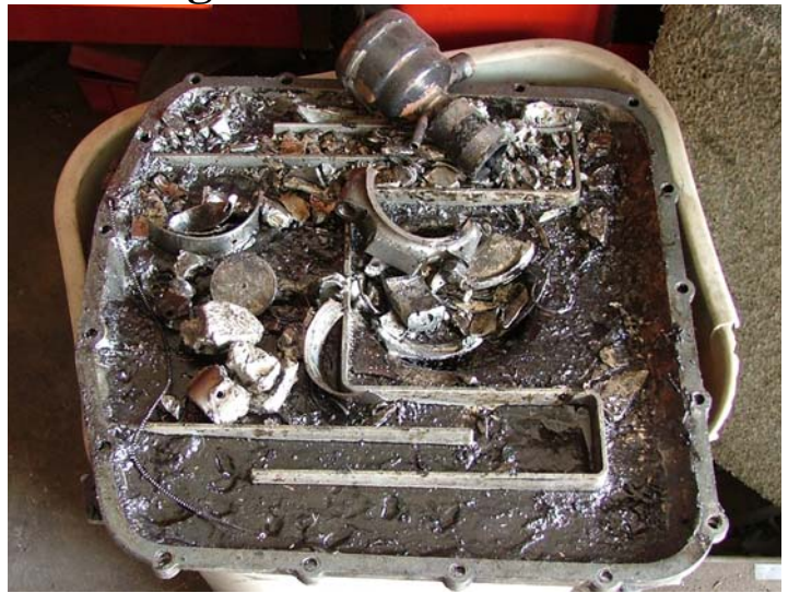
This pile of aluminum shavings is what can happen to your Alfa if you don't give it proper care and feeding!