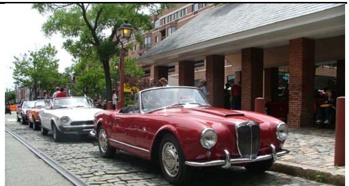
Not the streets of Rome, the streets of Philadelphia!