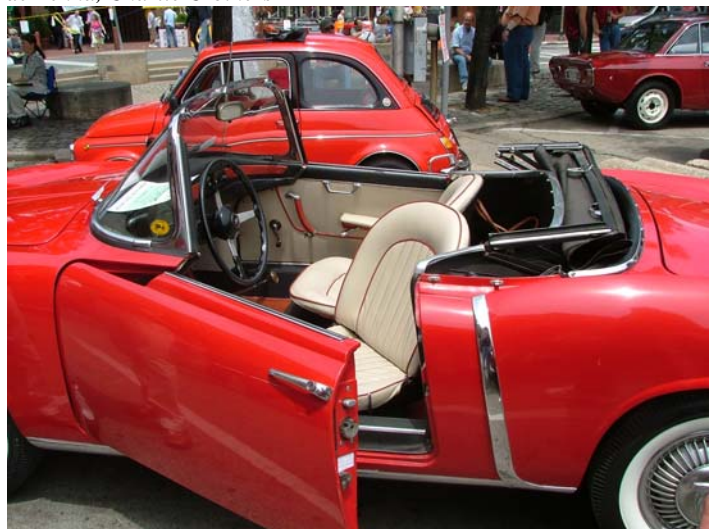
A lady's Fiat with swiveling seats to ease skirted entry.