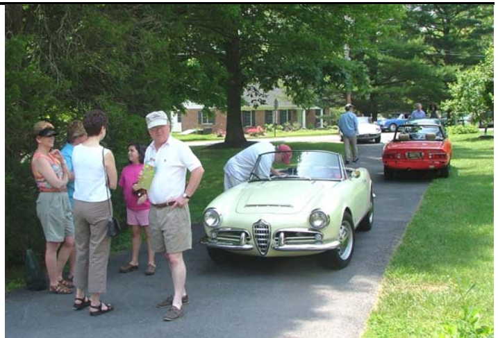
The driveway fills up with Alfa Romeos and their passengers.