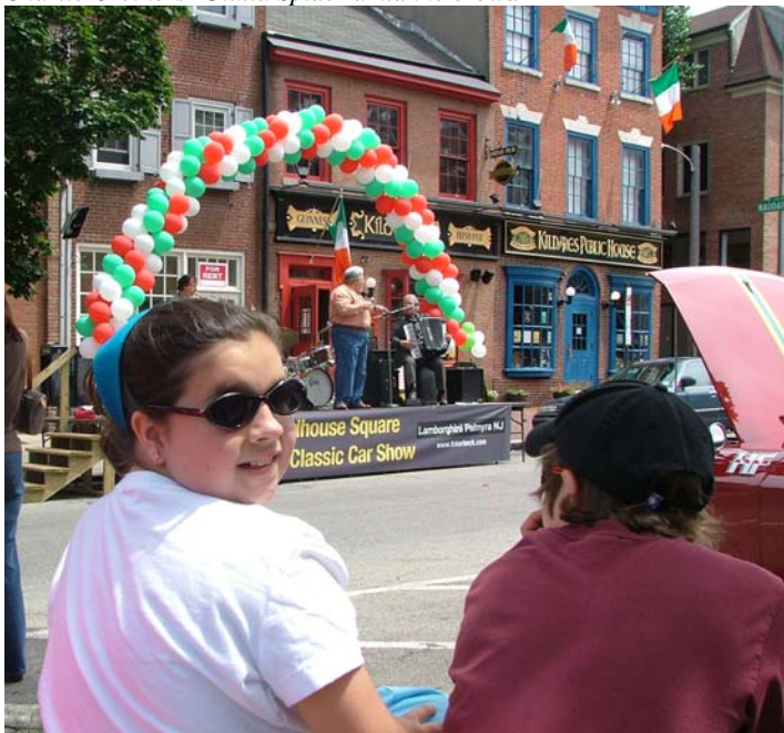
"La musica è molto piacevole, tesoro"