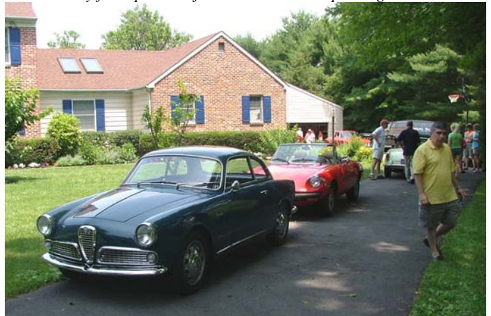
Pat Carzo checks out the cars as they arrive.