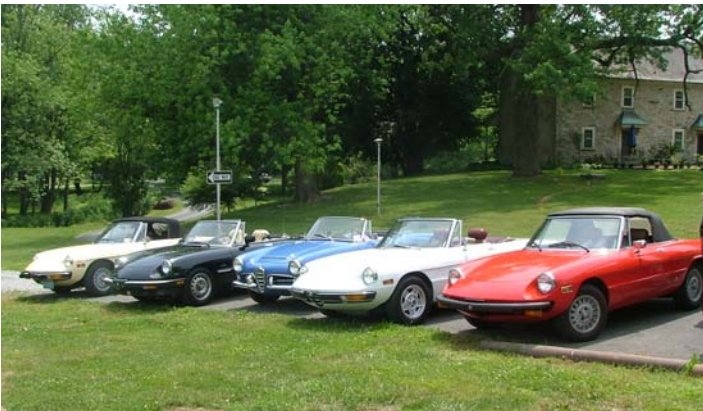
A pallet of Spiders grace the Twin Brooks Winery parking lot