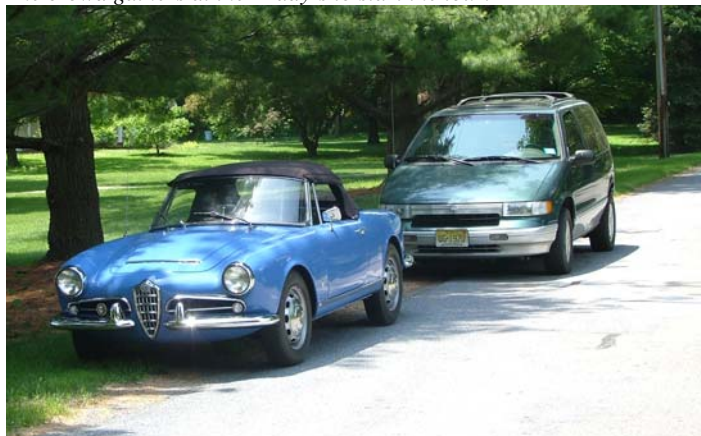
Some brought two cars... one for the tour and another for the highway trip over.