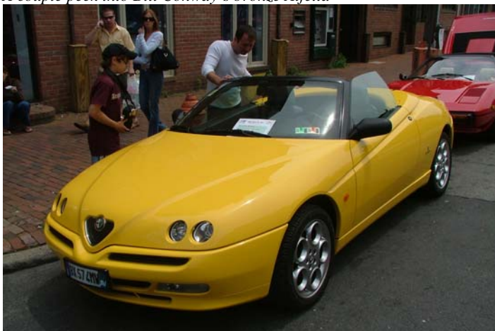
Rarely seen on these shores, a newer Spider made it to the show