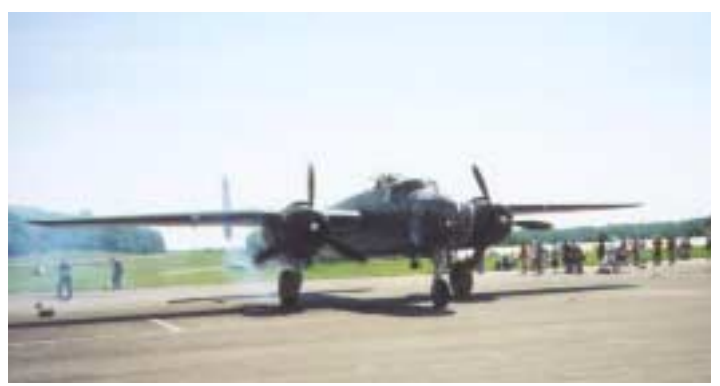
The B25 fires up its engines as it prepares for flight.

By the time the B25 took off, marking the end of the show, we had our fill of sun, fun, cars and planes. We'll be back next year