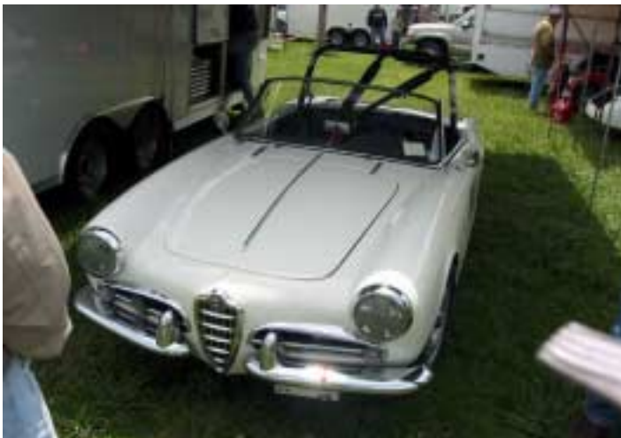
A NiceVeloce Spider Vintage Racer... Still Streetable

I was more interested in the white Veloce Spider. We spoke with the driver...Steven Lehrman. He's driven this car vintage for the past seven years. You can see he has not transformed the car much beyond driving on the street. All the original gages, windshield, wipers and motor, heater and rear license plate are still in place. You can see the roll bar only has a single diagonal fore and aft brace to the passenger side front foot well. He has installed a racing seat, boxed the radius arm attachment brackets, and installed a set of lovely aluminum wheels @ 5.5 x 15 (4.5 was original) (love the wheels). He said his mechanic purchased them in California for $300 a piece but does not know the brand. (He made the change when he heard of weld breaks with the original steel wheels.) Class rules require him to still run with drum brakes all around. Unfortunately, he also said he can pass only one or two cars in his vintage class.... but he is smiling all the same!