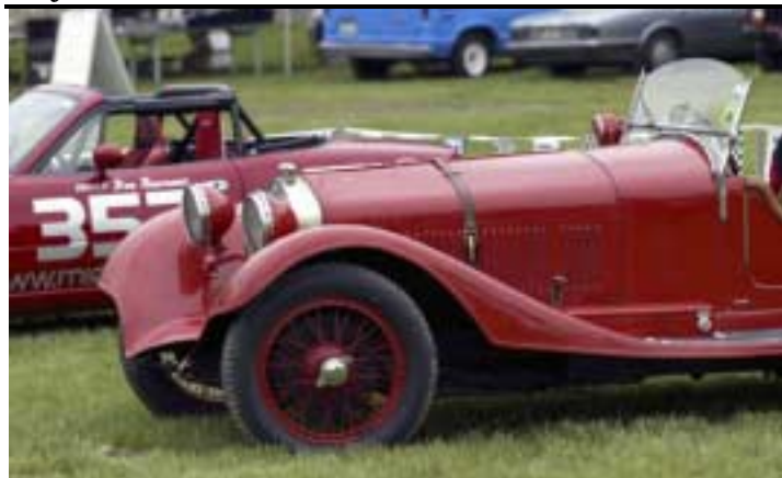
A 1933 6C1750 Alfa Romeo Graces the Parking Area of the Hershey Hillclimb.