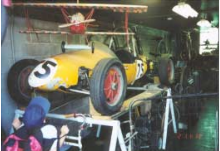
One of two Cooper Climaxes in the New Garden Airport Museum.