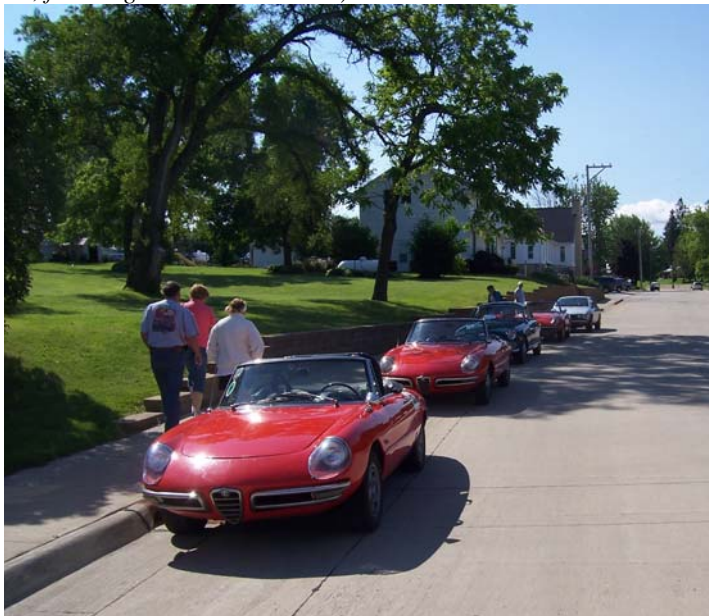
Cars line up for the start of the Fangio Tour