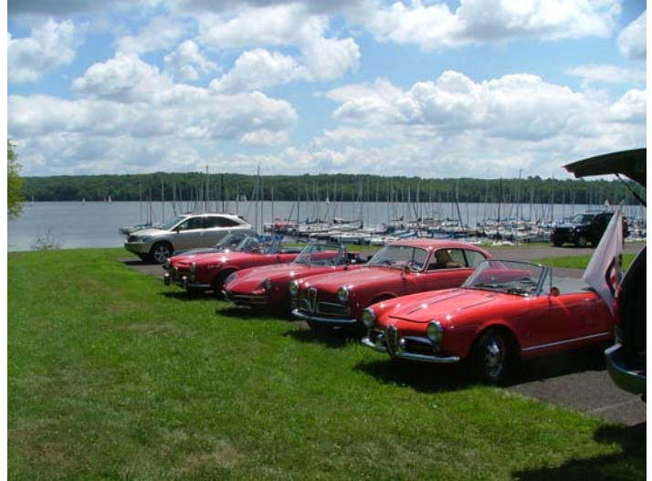
A lovely picture-perfect display of Alfas on a lovely picture-perfect day