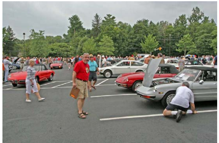
Contestants prepare their cars for the careful eyes of the scrutineers. Judging was improved this year. Next year's New Hope Auto Show promises to be even more Alfa friendly as there will be an Alfa-specific division.