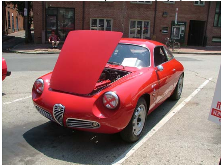
You never know what will show up to this show – a surprise SZ