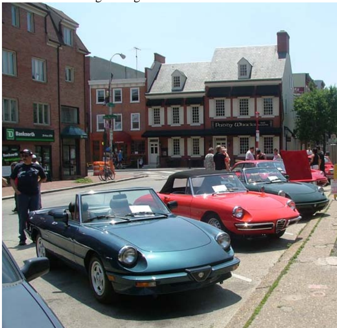
A sequence of Spiders in a line