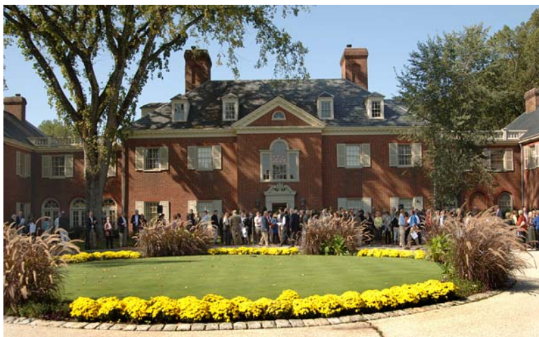
The front of the Brantwyn Mansion with the crowd of 300 guests eagerly awaiting the parade of exotic vehicles.

The estate's 60-acre garden setting offers a breathtaking backdrop for the exotic vehicles that you have enjoyed for the past two years. The Classics and the Brantwyn Estate offer diverse venues and creates the perfect social atmosphere for you to relax and enjoy.